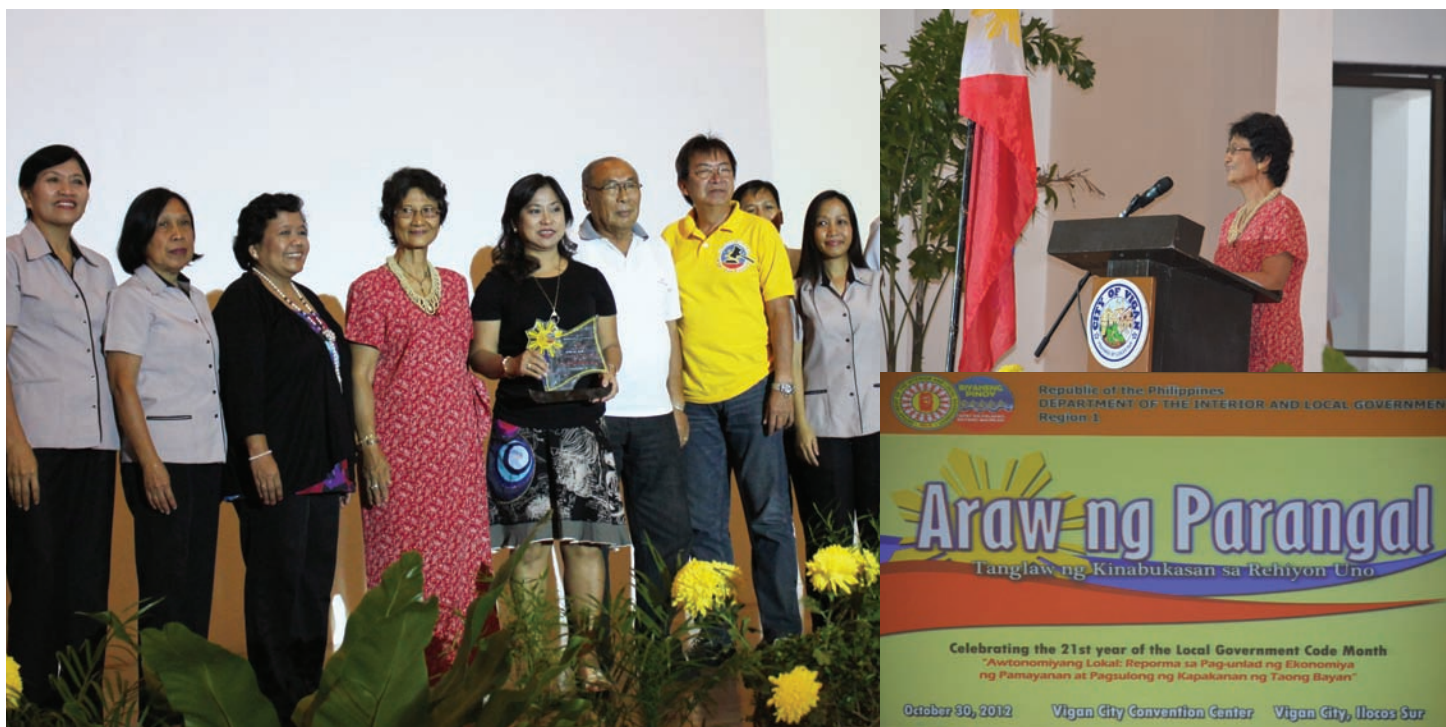
The Province of Pangasinan, Vigan City, Ilocos Sur, and San Nicolas, Ilocos Norte are the 2012 Gawad Pamana ng Lahi (GPL) Region 1 Champions and the nominees in the first – ever National GPL. (continued at page 3)