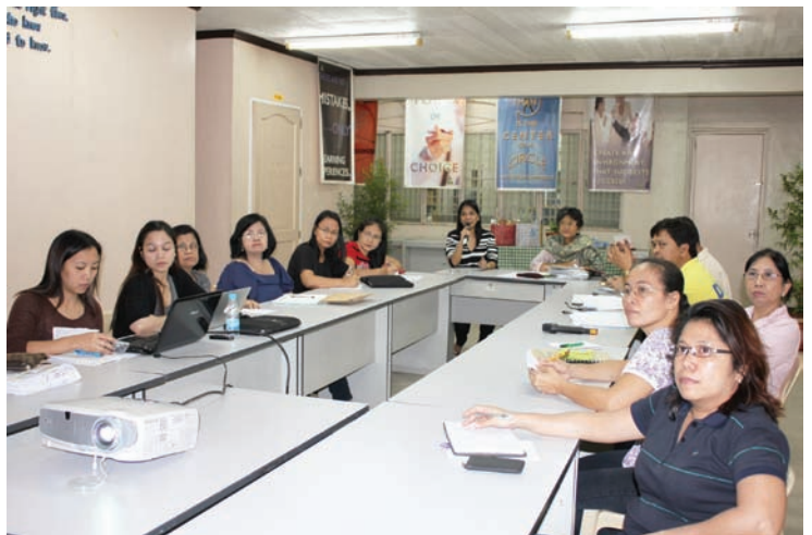
DILG R1 personnel pay attention to the findings of the Central Office - Internal Audit Service (IAS) during the Exit Conference, where implementation of PCF Projects is one of the highlights.